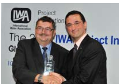
Customer services activities, Linz AG Wasser (Austria)