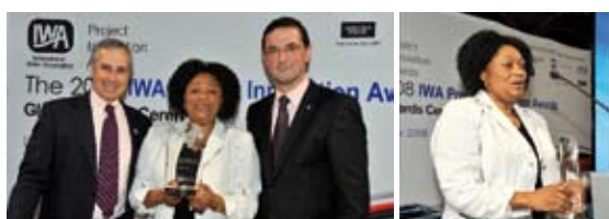
Overall Winner 2008, Rand Water

This competition is arranged by the IWA Marketing and Communications Group. The purpose of the award scheme is twofold: