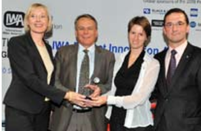
Best water professionals recruiting programme, OVGW (Austria)