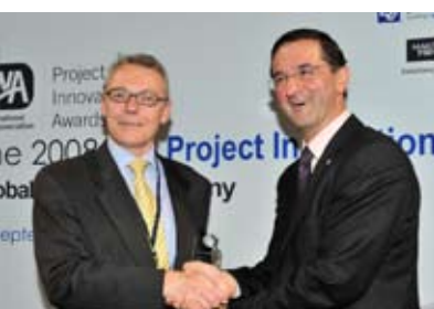
Best promoted water protection activity or programme, Queensland Water Commission (Australia)