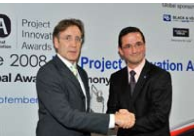
Best popular presentation of water science, WaterReuse Association (USA)