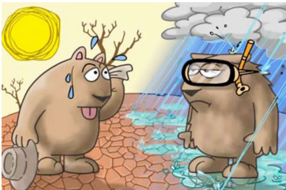
A summary of the effects of climate change on Australia!