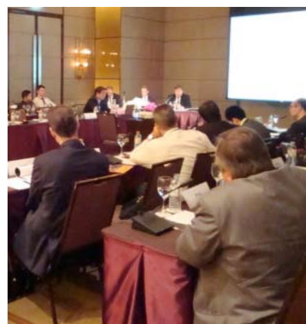
Top: 2009 WaterLinks Forum, 28-30 September 2009, Bangkok - Thailand. Bottom left: Water Innovation Fair and Networking Session at the 2009 WaterLinks Forum. Bottom right: Development Partners Discussion on Future Cooperation with WaterLinks at the 2009 WaterLinks Forum.

Parallel to the forum, the Water Innovation Fair was also held at the same venue where selected operators displayed their innovative best practices for expanding or improving access to safe water and basic sanitation.