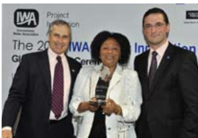
School information programme, Rand Water (South Africa)