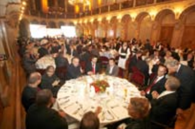
Awards Dinner, Palais Ferstel (Austria)