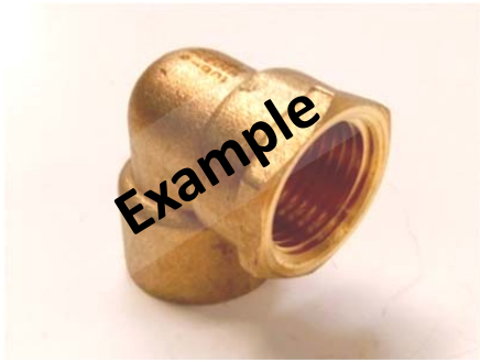
Female 90° Elbow with End (15-28mm)