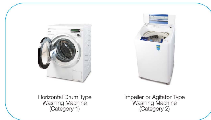
Horizontal Drum Type Washing Machine (Category 1)

Conversion of Water Consumption to Water Efficiency Grades for Washing Machines of Horizontal Drum Type (Category 1) and Impeller / Agitator Type (Category 2)