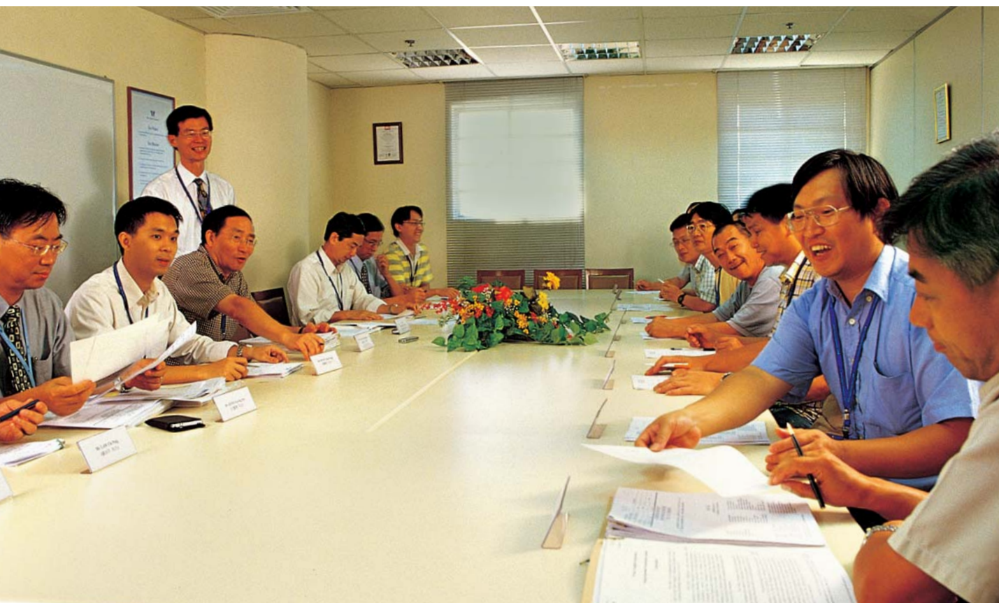
▲ 職員協商委員會的其中一個小組委員會會議。 Staff at DCC Sub-committee meeting.