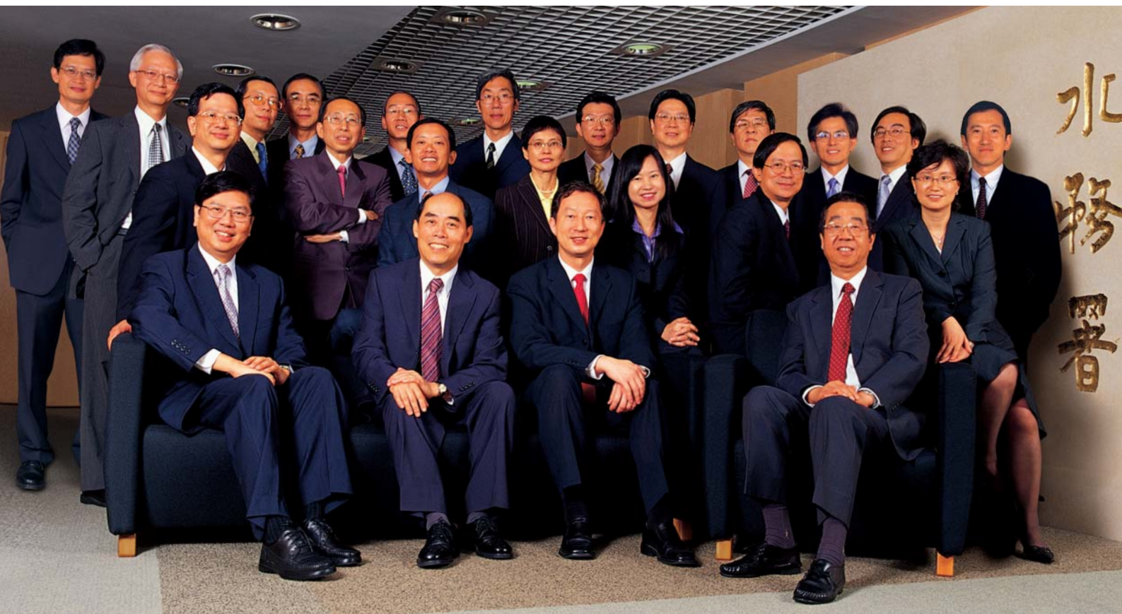
▲ 首長級管理人員。 Directorate Staff at management.

This year, about $2.6 million was spent on training staff to carry out such tasks as providing a one-stop service to all customers through the newly computerized Customer Care and Billing System, and conducting courses on improving supervisory and managerial capability in a committed work force.