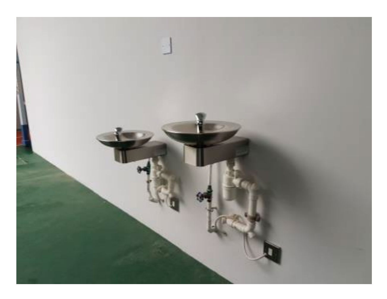
Water Supplies Department Hong Kong Special Administrative Region Government