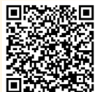
收據範本 Sample Receipt