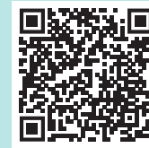
Application Form: WWO 1156