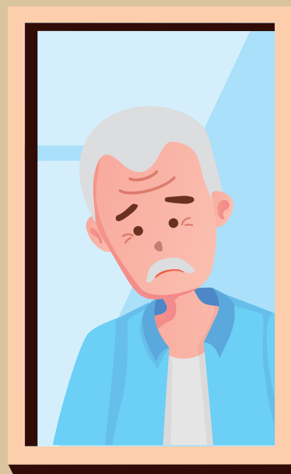
分間單位租戶 Tenant of sub-divided flat