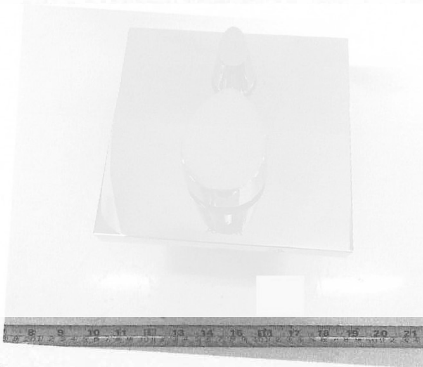
Figure 2 - Seat bore