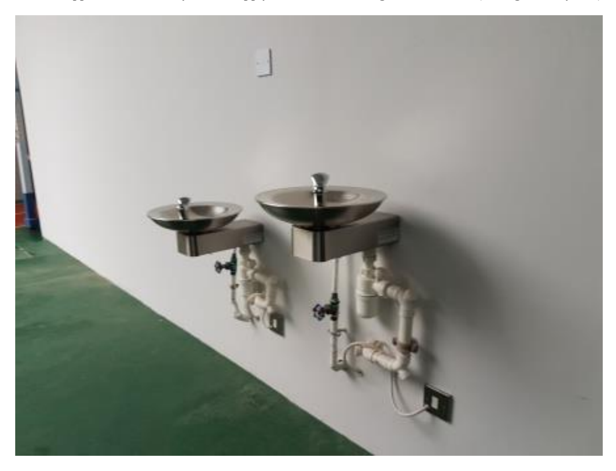
Water Supplies Department

for the application of Quality Water Supply Scheme for Buildings – Fresh Water (Management System)